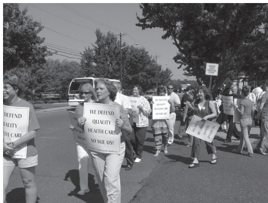
HPAE demonstrators at Bergen Regional Medical Center

On June 23, the nurses and health professionals at BRMC went back to work after reaching a contract agreement with the hospital. "We have moved forward in our goals of achieving safe