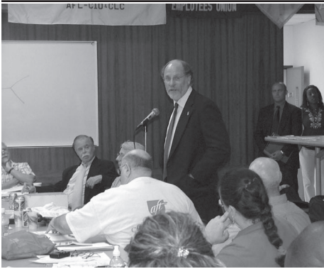
Senator Corzine addressing Council delegates

stitutions and pledged to impose a far greater degree of central oversight and accountability over the nine State colleges/universities.